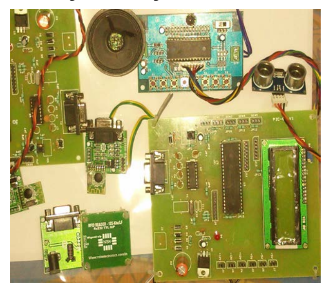
Fig. 5. Hardware module

the tag will be present in the bus, so that the user can easily read the tag in the bus using RFID reader.