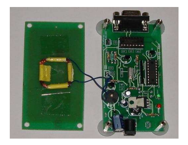
Fig. 4. Block Diagram RFID Tag

The diagram which is shown above is RFID reader and tag, which is used in the bus and user's module to track the bus as mentioned above. When the user is having the reader