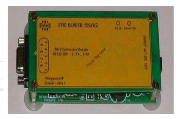
Fig. 3. Block Diagram of RFID Reader

The tests have been done after all the modules got ready. The following pictures showed the each module denoting the system.